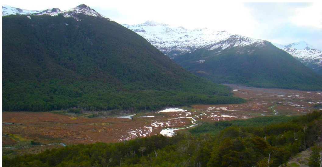
Peatlands in La Piedad Valley, Karukinka Park