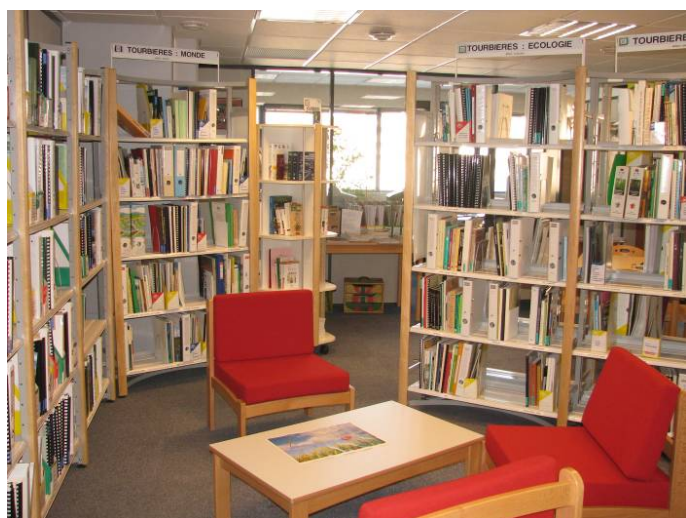
The documentation centre of « pôle-relais tourbières » in Besançon, Franche-Comté. Photo F. Muller, 2009

- the completion of studies , like one in the region Franche-Comté, on how to make field sites accessible to the public without damaging the mires.