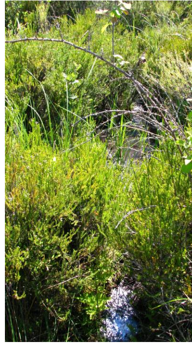
The percolation mire of Bagliettu, Moltifao, Corsica.

New sites may be added to the Ramsar network, like original Mediterranean mires on Corsica, near the village of Moltifao.