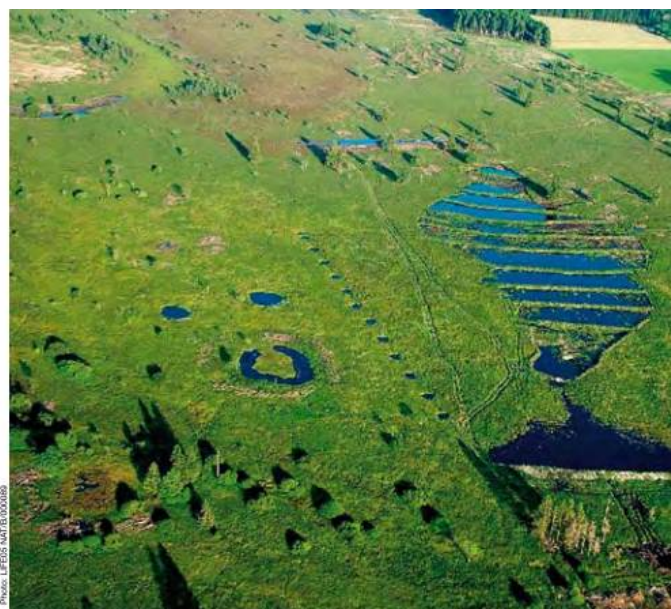
LIFE restored open landscapes and enhanced connectivity between fragmented bog habitats in Belgium

elements. As a result of drainage, widespread spruce plantation and the abandonment of traditional extensive agricultural, this area of heaths, fens and bogs has been reduced from some 20 000 ha at the end of the 18th century to just 5 000 ha today, much of which is in a degraded state.