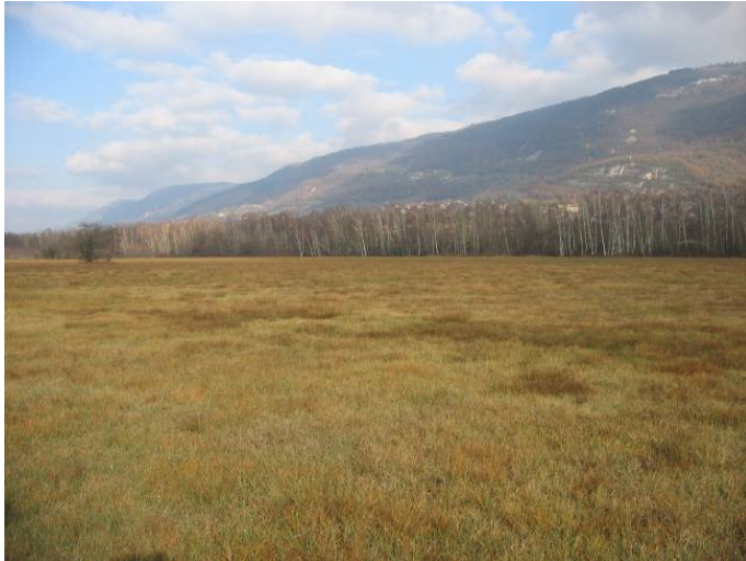
The fens of Chautagne, Rhône-Alpes, photo F. Muller, 2006

In French Overseas Territories , mires are found in the Ramsar sites of: