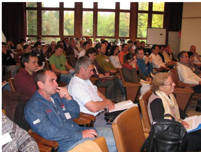
Meeting in Grenoble, Rhône-Alpes, about how to limit the negative effects of winter sport resorts and tracks, on mires and other wetlands. Photo F. Muller, 2008

- the support of regional projects , like in the Alps and in the Paris Basin. Following the recent creation of a Conservancy in French Guiana, we met with colleagues from Guiana to scope the mires between the coastline and the large forests to arrive at a protection plan for these sites.