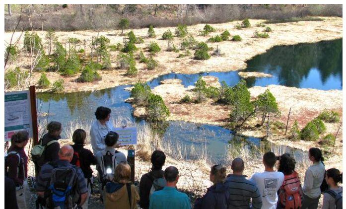
RNN of Lac Luitel, near Grenoble, Rhône-Alpes, the first official French Nature Reserve, celebrates its 50th anniversary in 2011. Photo F. Muller, April 2011

The nine National Parks (PN) of France include few wetlands and even fewer mires, except for Cévennes PN. A proposed new forest PN between Burgundy and Champagne will include interesting tufa formations. A Wetlands PN is also planned, but the three projects presented (none including significant mire areas) have faced significant local opposition. Several National Nature Reserves (RNN) include mires, both fens and bogs and are protected and managed by the network of French Conservancies federated by FCEN. They are complemented by Regional Nature Reserves (RNR), like the one protecting the relatively large mires area of Frasné, in Franche-Comté. But the political dynamics are very different from one region to the other.