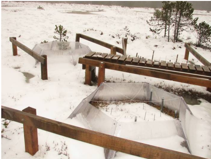
A measuring station of the 'Peatwarm' programme, in Frasné, Franche-Comté. Photo F. Muller, 2009

- the 'μPOL-AIR' programme , using Sphagnum bogs to quantify long distance deposition caused by air pollution.